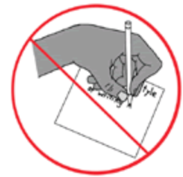
Figure 1. "Hooked" writing

The most important factors are: the position of the writing paper, the position of the arm and wrist, and the grip on the writing instrument.