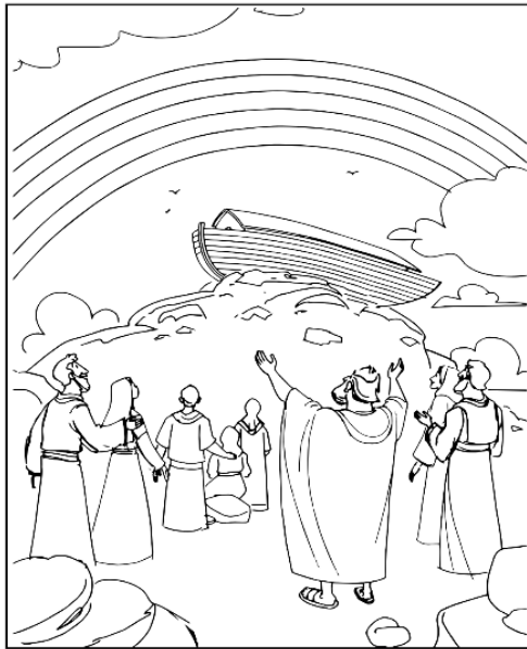
God made a promise to Noah.